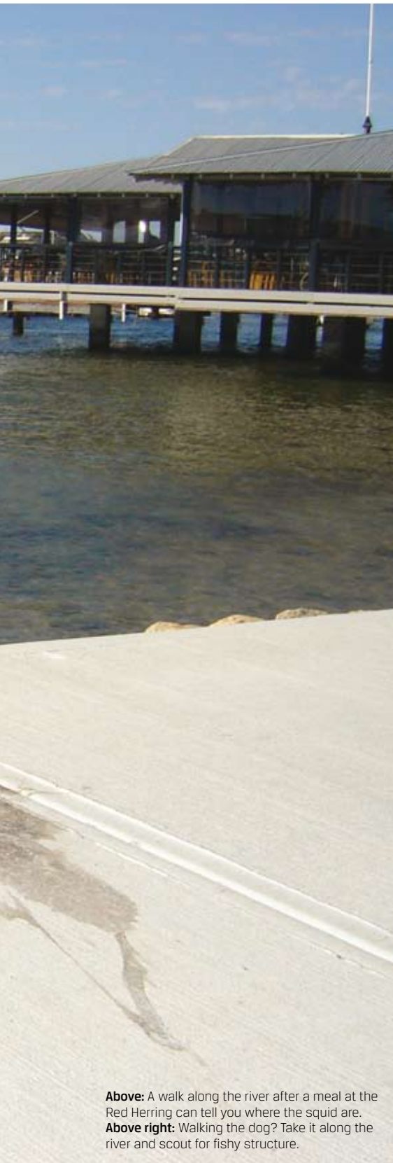
Above: A walk along the river after a meal at the Red Herring can tell you where the squid are. Above right: Walking the dog? Take it along the river and scout for fishy structure.

feeding hours or their spawning times, increases.